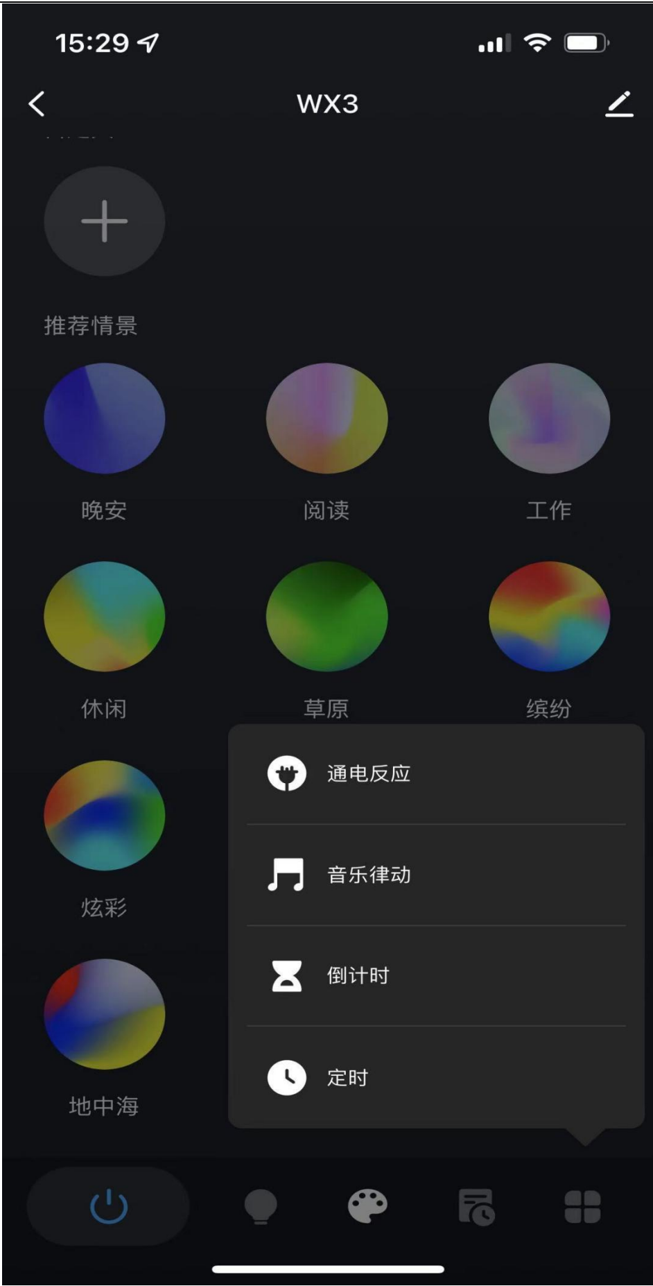
4: Music Groove and Timing: There are four modes: power-on response, music rhythm, countdown and timing.