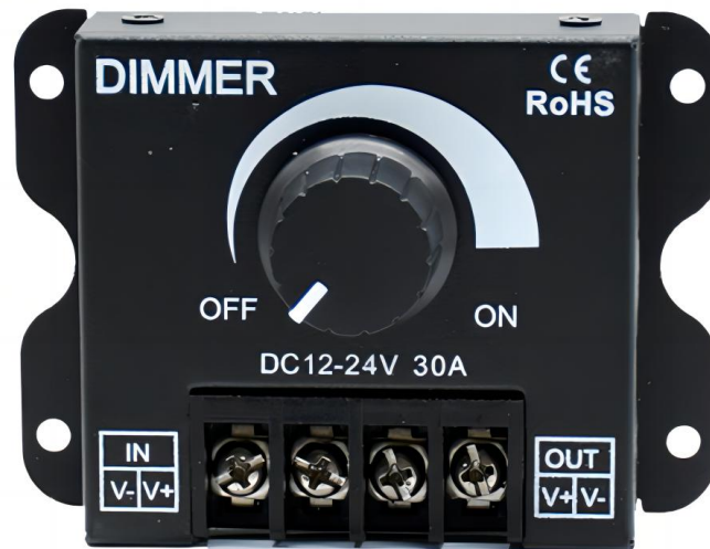
PRODUCT NAME: DIMMER MODEL: XDIMMER-1CH-30A